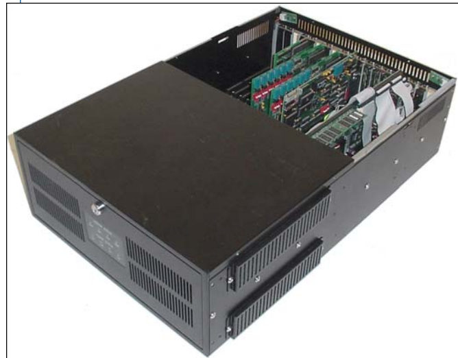
XANALOG ReaLINK for Simulink is a ready-to-use, out-of-the-box system that seamlessly links with The Mathworks Simulink